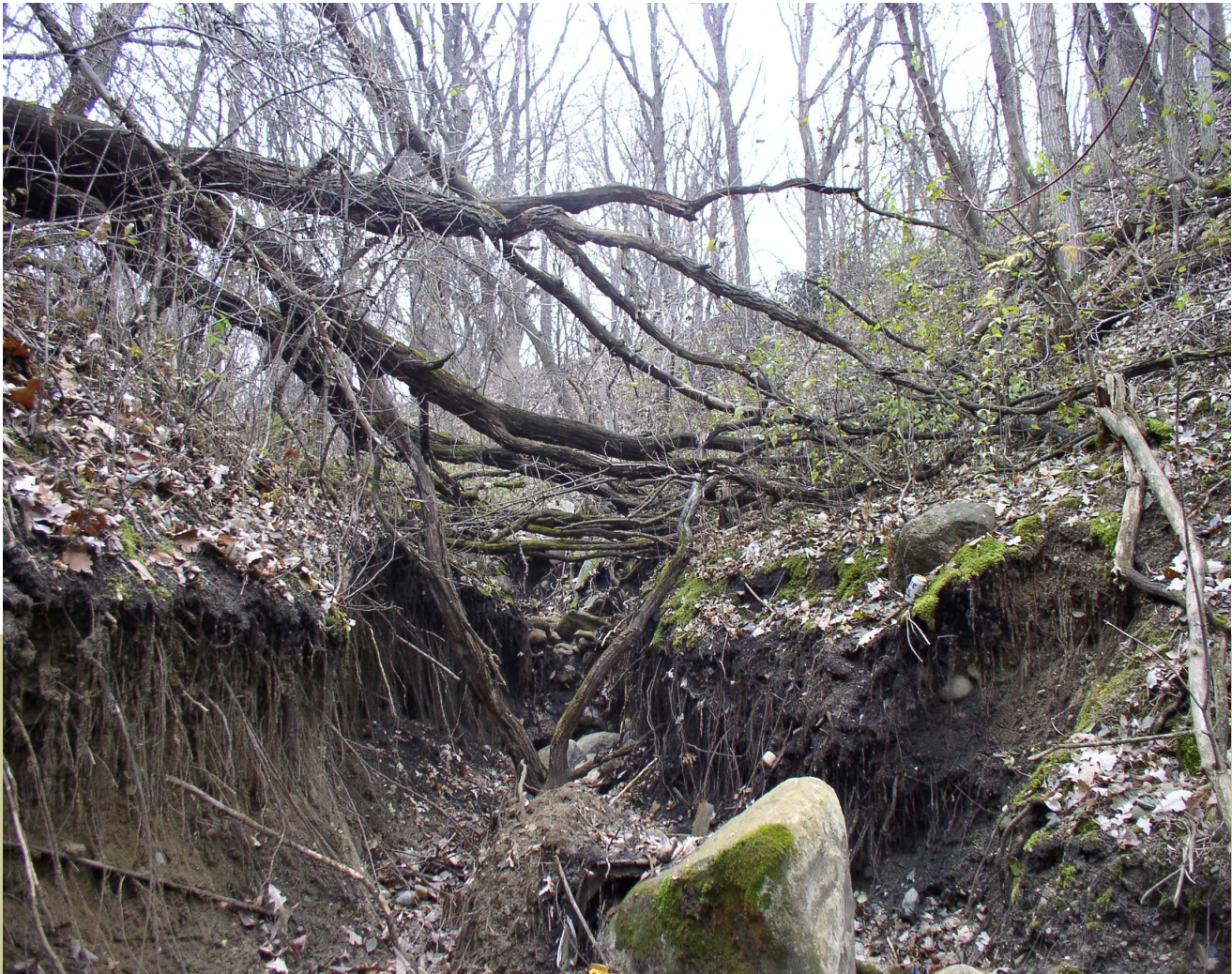
Existing Ravine located in Dairyland Basin